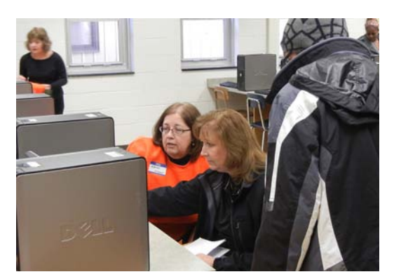
Indianapolis - Northwest